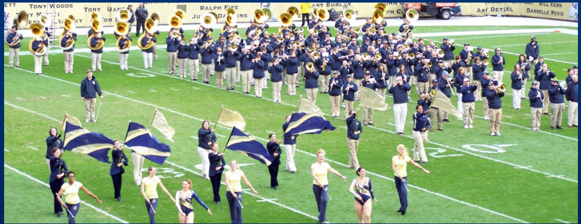
Alumni band members perform the halftime show in P-I-T-T formation (second 'T' pictured).

at Heinz Field for the Pitt vs. Utah football game. Clothed in special edition 100 Year Pitt Band jackets, the alumni first joined with current band members in the pregame concert and the march into the stadium.